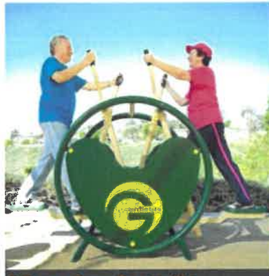
2-Person Cross Country Ski