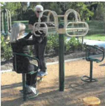
4-Person Twisting Station