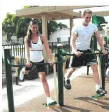
2-Person Air Walker