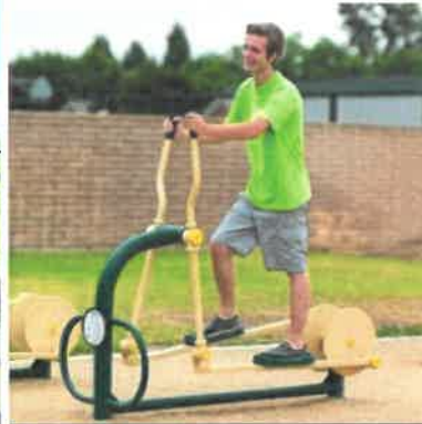
Elliptical Cross Trainer