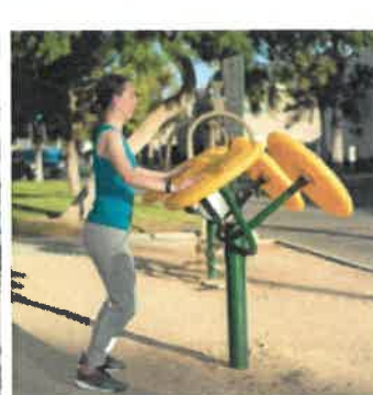
2-Person Tai-Chi Spinners