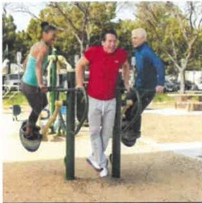
4-Person Pendulum, Abs, & Dips Station