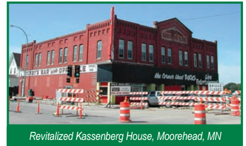
Revitalized Kassenberg House, Moorehead, MN