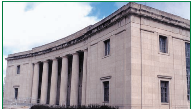
The Consumer Energy Headquarters Property in Jackson County, Michigan, before revitalization (above) and after (below).

The period of performance is three years.