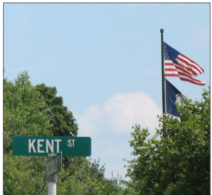
Flags fly high at the County Administration Building as seen from the corner of Kent and Piccadilly Streets.