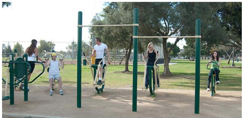
Example of an adult fitness park.

If the project goes as hoped and grant funds are received it will represent another example of how strong partnerships can bring recreation development, and the quality of life improvements that go along with recreation to the community. In this case the partners include Frederick County, VDOT, and the development community. So be on the lookout for news of the VDOT Recreation Grant Program awards, and let’s hope we can continue to transition all of Sherando Park to its intended purpose!